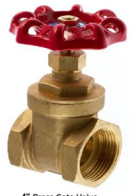
4" Brass Gate Valve