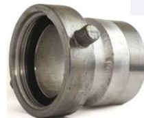
4" BSP x 4" BSRT Female Adaptor