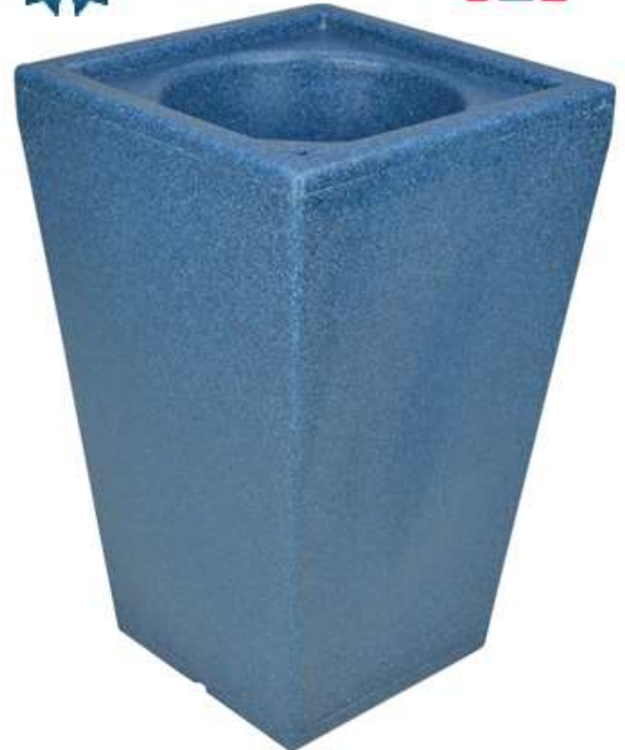
Planter shown with bowl left in